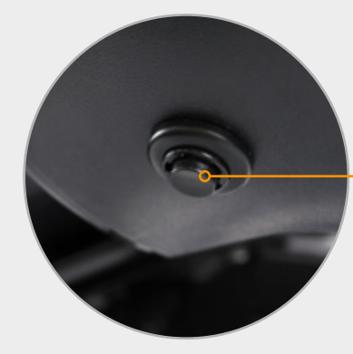
Air release seat £100 For a softer seat release

Coccyx cut out reduces the pressure applied to the coccyx at the base of the spine while seated. The foam in the area has been replaced with a lower density to relieve pain.