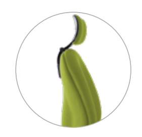
Full Fabric back with headrest