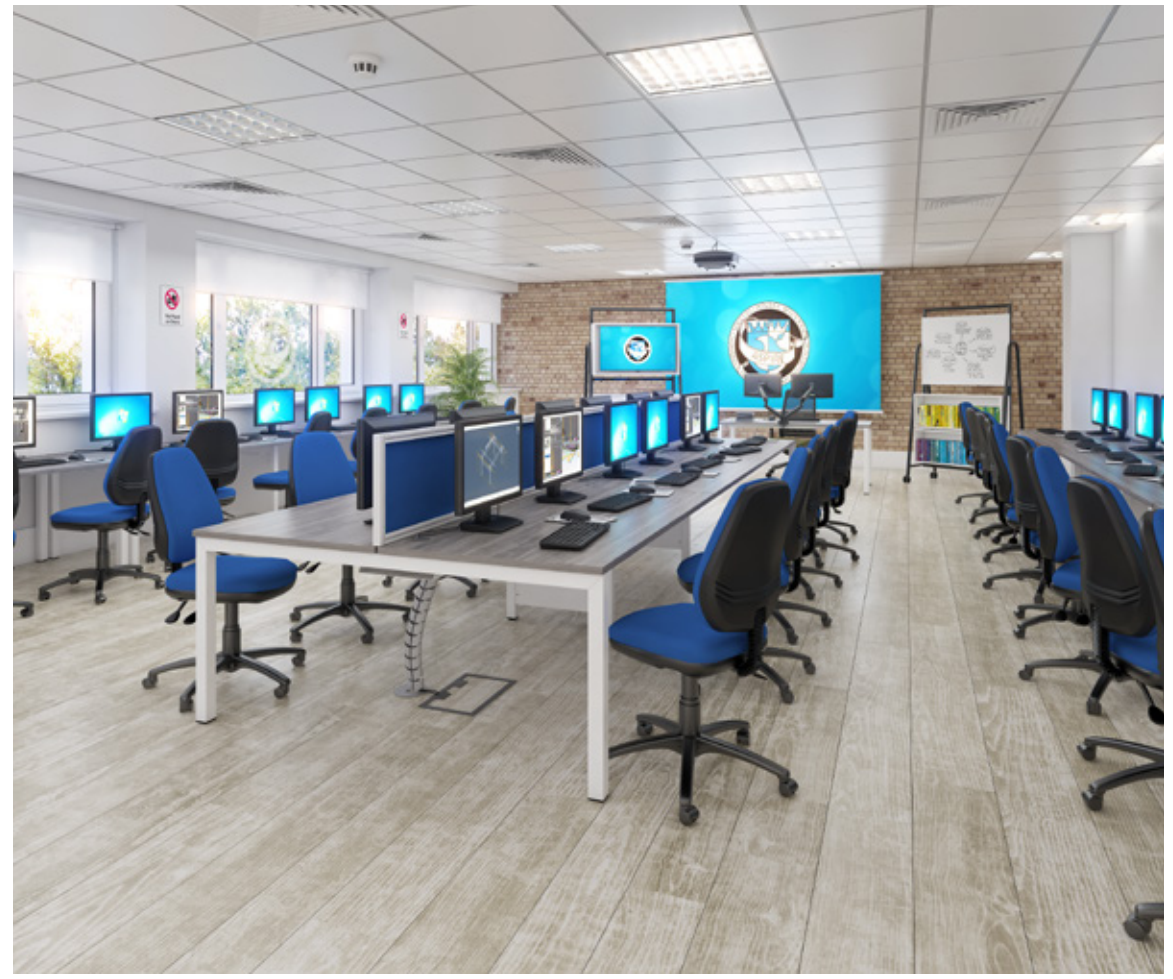
DESK FRAME colours

The legs can be shared between bench clusters, which not only look aesthetically pleasing, but save space and decrease costs.